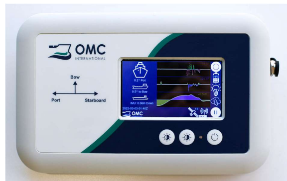
Figure 2 iHeave® v2 touch display and control buttons

The older iHeave® device relied on USB sticks for data transfer, and LED indicator lights for device status reporting. The new device features a touch-enabled live status display to allow users to check that the device is operating and recording motions at a glance (Figure 2). It is also capable of sending this data via mobile networks, allowing for the data to be used in near real-time.