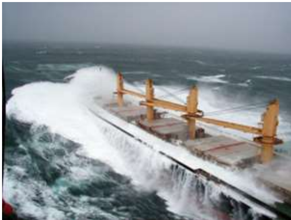
Figure 1 Hazardous conditions at the Columbia River Bar

The collection of this validation data can be challenging since vessels under pilotage are often high-stress environments with little leeway for the set up and care of extra instrumentation, especially during the weather conditions of particular interest for vessel motion modelling (see Figure 1). Under these conditions, the setup and tear-down of measurement equipment is an extra burden that must be kept to a minimum for the safety of all.