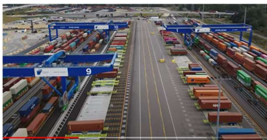
Figure 2 – GPA. Automated RMG, de-coupled truck

Georgia Port Authority (GPA) – decoupled wheeled operation using perpendicular buffers. (see Fig 2)