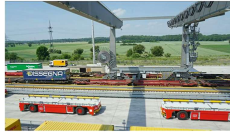
Figure 3 – Lehrte, Rail Mega hub, AGVs

for moving containers within the terminals. This terminal has only recently started operation. (see Figure 3)